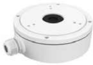
DS-1280ZJ-S Junction Box