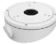
DS-1281ZJ-S Inclined Base Mounting Bracket