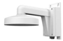
DS-1272ZJ-110B Wall Mounting Bracket