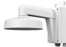
DS-1272ZJ-110 Wall Mounting Bracket