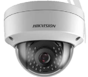
Non 2.8 mm Fixed Focal Lens