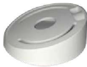
DS-1259ZJ Inclined Base Mounting Bracket