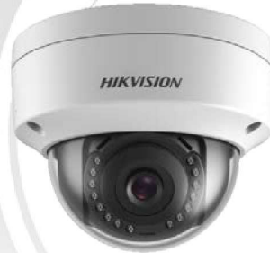
2.8 mm Fixed Focal Lens