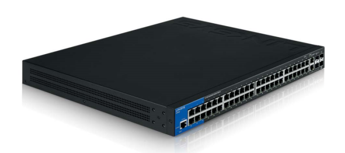
52-Port Managed Gigabit Switch (LGS552)